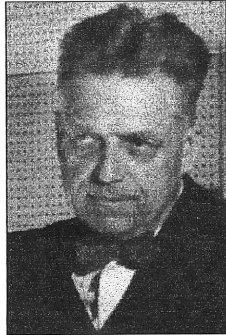
Kinsey: Fraud behind his "findings."