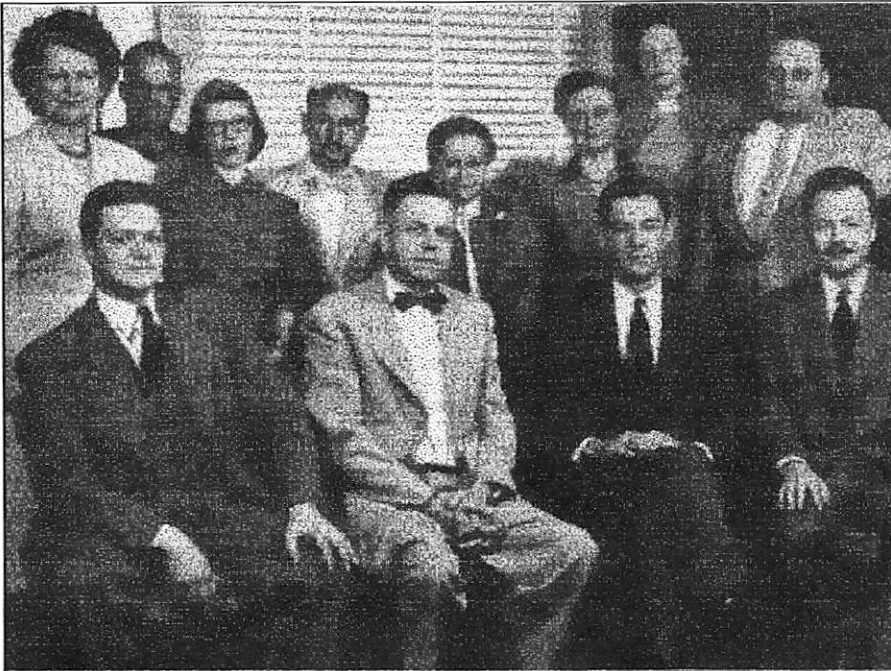
Kinsey with his staff and co-authors: A veneer of respectability.

But even if we should wish to discount the statistical effect of using criminals, sex offenders, and sexually aggressive volunteers, there is still ample reason to dismiss the validity of Kinsey's findings. The author tells us